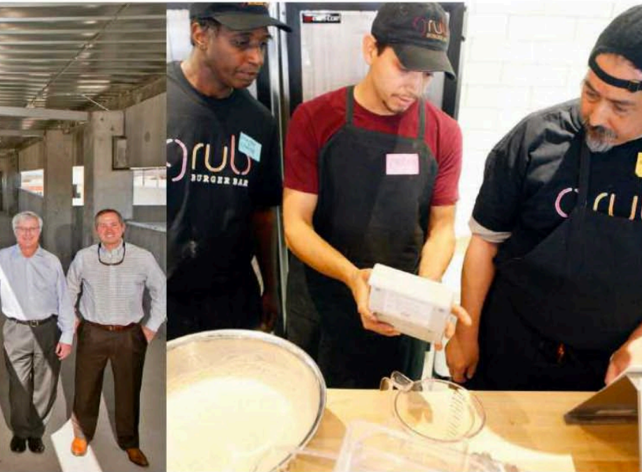
Grub Burger Bar opened July 14 and the Midland location is No. 1 in sales among the College Station-based chain's 10 nationwide locations.

One may assume the clientele at Grub Burger Bar is mostly the rush of male, young oilfield